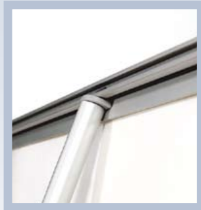
Insert the supporting rod above. Ready!