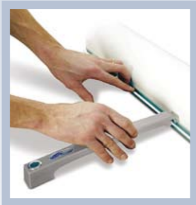
Well-thought out design down to the finest detail. Simply click on the stabilizing foot at the bottom.